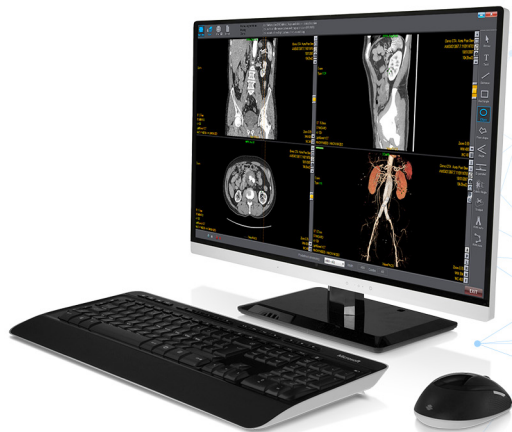
RemoteViewer interface for radiologists with advanced features