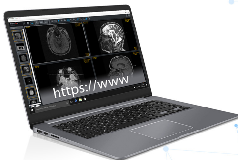
WEB-based interface for clinicians with external access