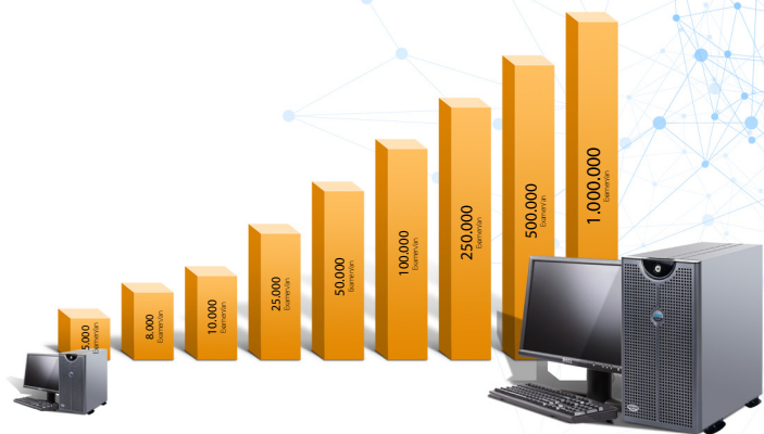
Archiving module adapted to each site